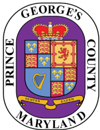
Angela D. Alsobrooks County Executive

As we look ahead to the 2024 Legislative Session, our commitment remains unwavering. We aim to continue working tirelessly to secure legislative victories that will elevate the quality of life for the nearly one million residents proudly calling Prince George's County home.